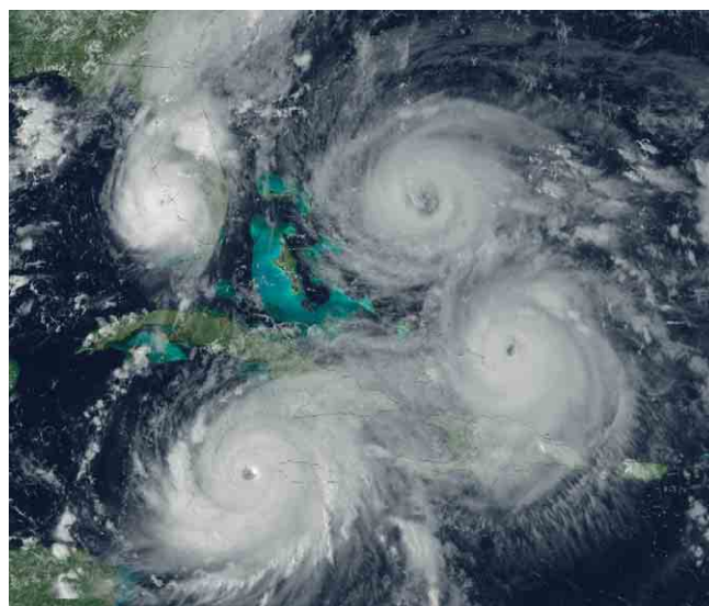
FIGURE 1. COMPOSITE SATELLITE IMAGE SHOWING HURRICANES CHARLEY, FRANCES, IVAN AND JEANNE "APPROACHING" FLORIDA AND US LANDFALL IN AUGUST AND SEPTEMBER 2004.